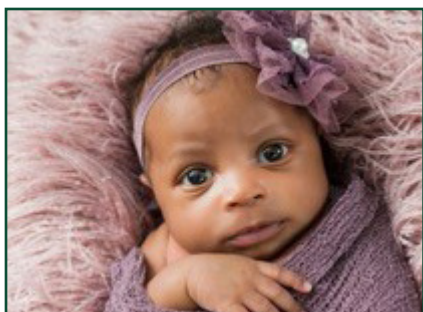
CHIZARA - FEB. 23