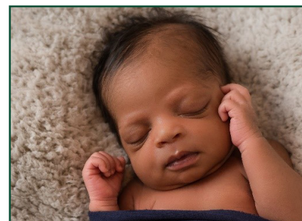
NYEIM - APRIL 15