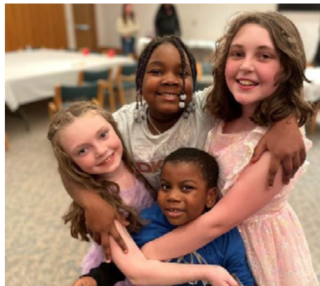
The children of the moms pictured left, at the 2025 Ladies of Charity dinner