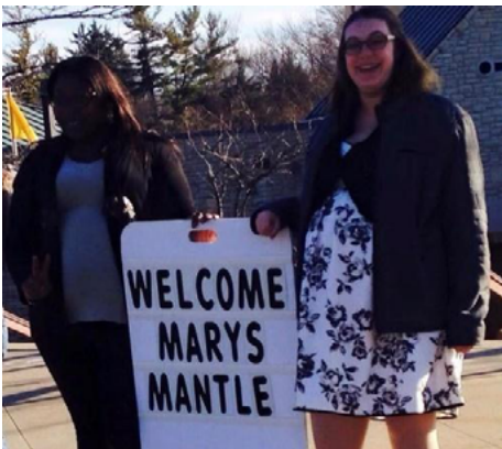
Mary's Mantle moms at the first Ladies of Charity/Mary's Mantle dinner