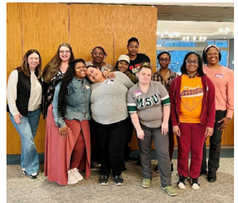
The whole Mary's Mantle crew at the 2025 dinner